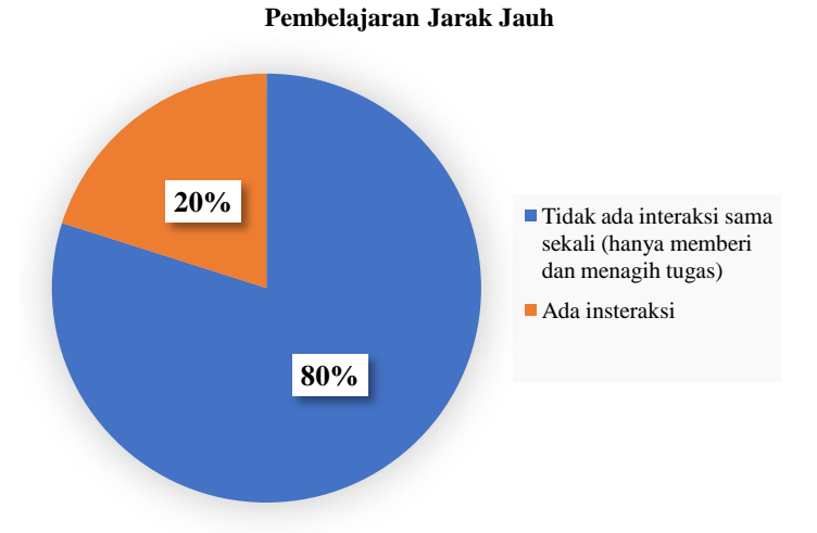
Figure 6.Madrasah Teacher Interaction Quantity Survey

Kuantitas Interaksi Guru Madrasah Selama